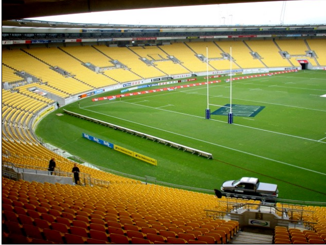
Westpac Stadium stands