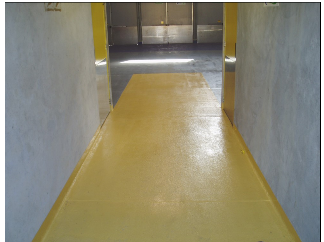
Finished Vulkem Application in walkway