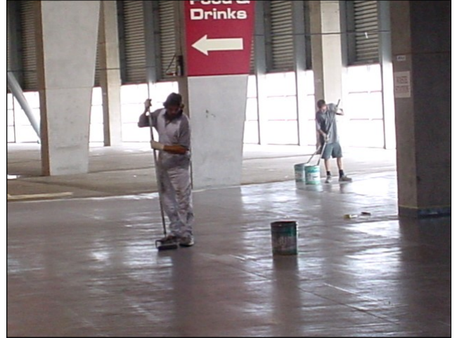
Vulkem membrane application