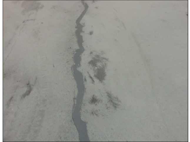
Crack repair with Sealboss crack injection