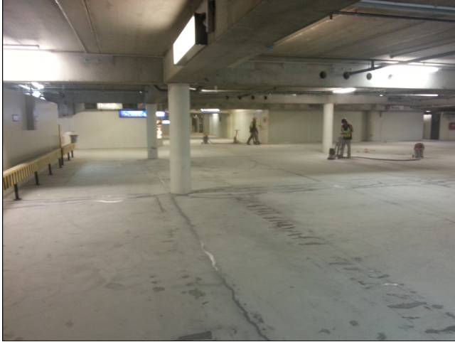
Concrete substrate preparation