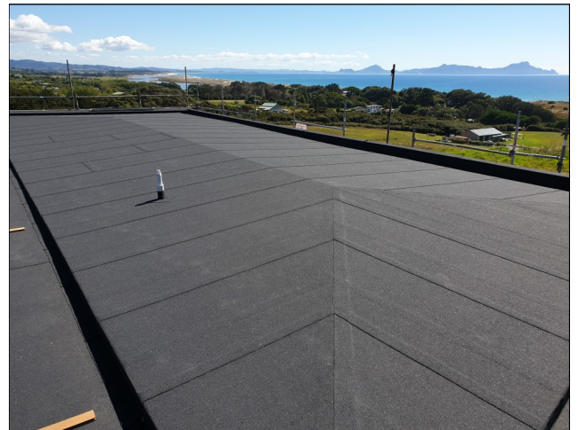
Finished DuO capsheet application