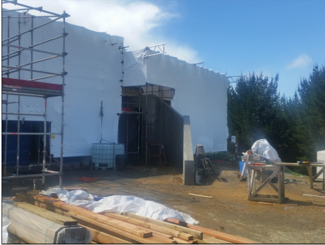
New build underway