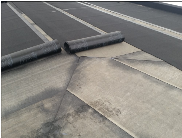
DuO AGR Capsheet installed over basesheet