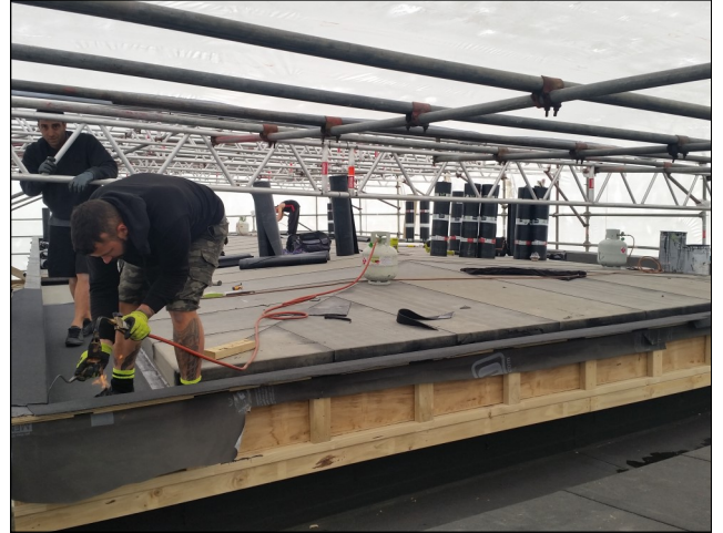
Deboplast Basesheet installed over plywood roof