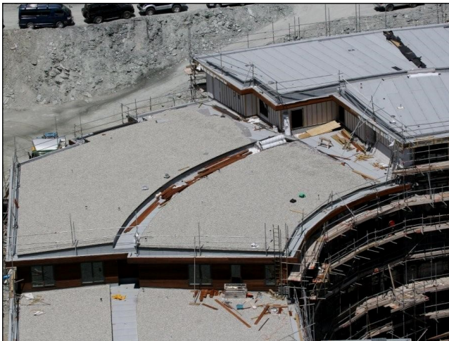
Ballast overlay over completed De Boer DuO Roof