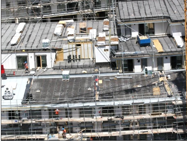
Basesheet membrane application