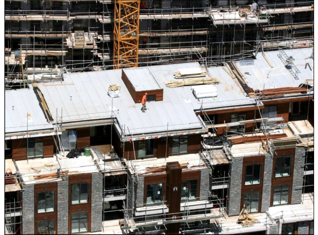
De Boer DuO capsheet application to roof and balconies