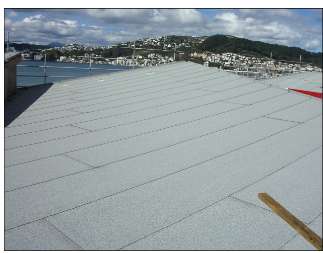
Finished De Boer DuO capsheet membrane

Project Name: Kumutoto — Meridian Energy