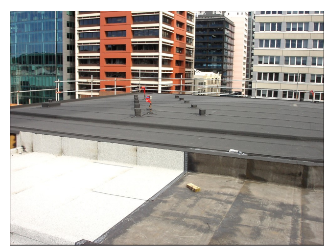
Basesheet membrane application