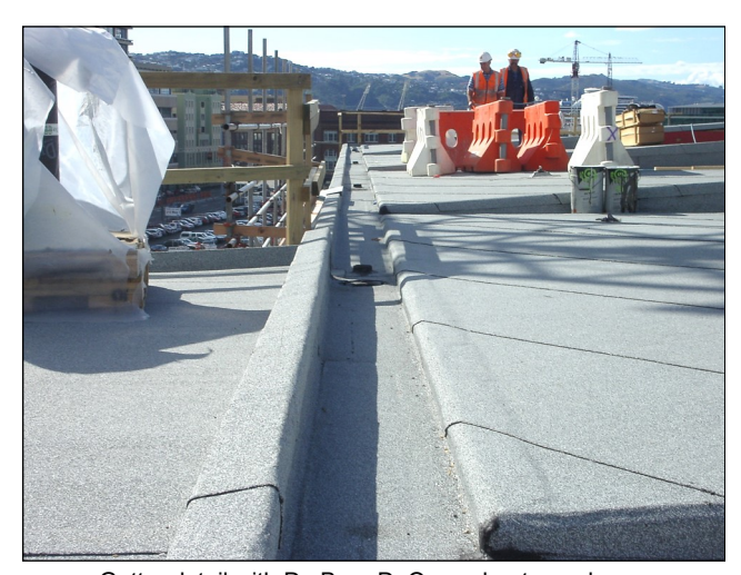
Gutter detail with De Boer DuO capsheet membrane