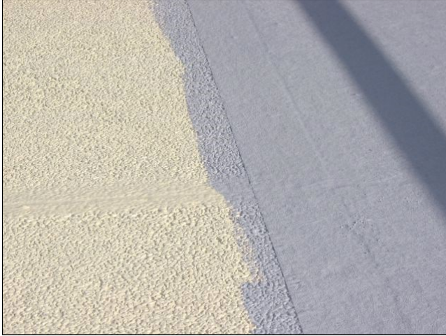
Dex bodycoat and Fiberglass laid over concrete substrate