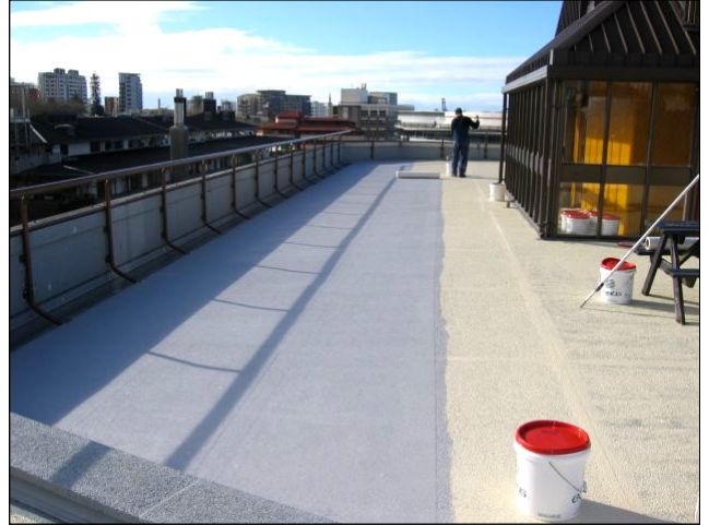
Dex bodycoat and Fiberglass laid over concrete substrate