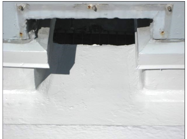
Chevaline Dex detailing