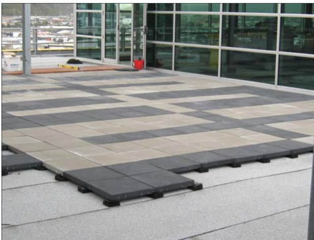
Installing pavers on pedestals

Project Name: Victoria Street, Petone Location: Lower Hutt Project: Office Building Type: Equus Duotherm system Project Size: 1000 sqm Product(s): Two layer De Boer DuO HT 4 over Kingspan PIR Thermataper Board Certified Applicator: Builders Plastics Main Contractor: Mc Kee Fehl Constructors Ltd Completion Date: 2009