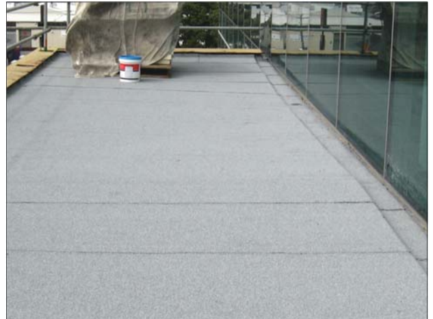
De Boer DuO capsheet