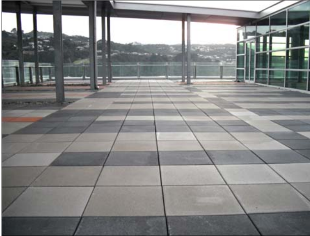
Completed warm roof with pavers