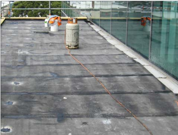
Mechanically fastened basesheet