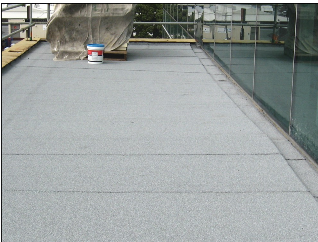
De Boer DuO Capsheet application