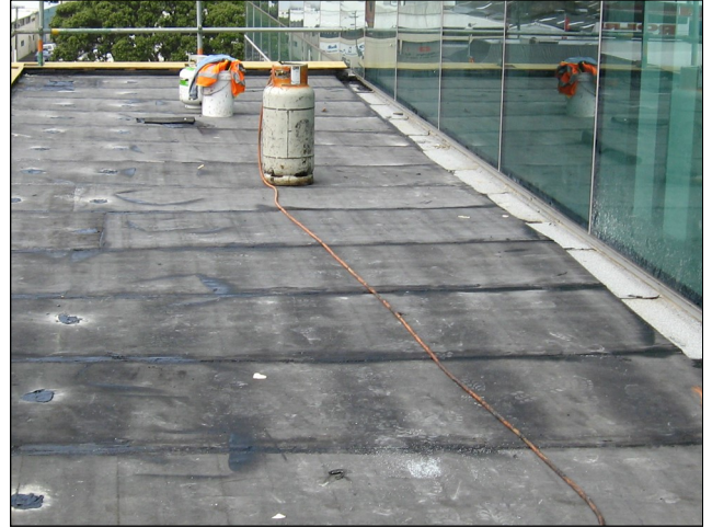
Mechanically fastened basesheet application