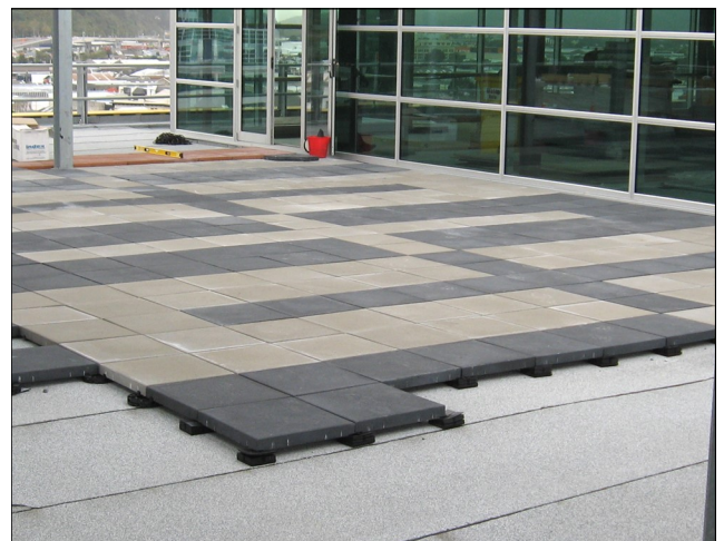
Installation of pedestals and pavers over DuO membrane