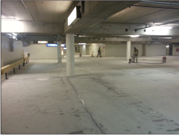
Concrete substrate preparation