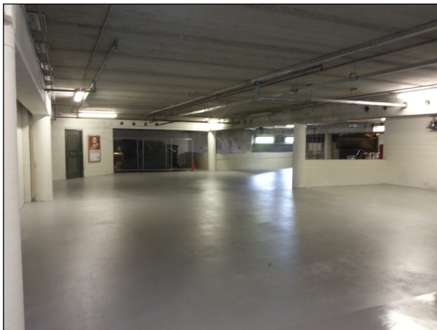
Finished coat of Epistixx CP